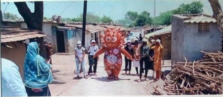
Sonwad TS, Maharashtra, India Old Mohida Rd, Sonwad TS, Maharashtra 425409, India Lat N 21° 30' 36.0468" Long E 74° 31' 21.1728"