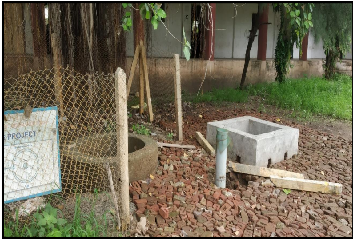
Rain Water Harvesting Project